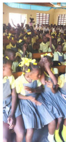
FAR LEFT: hundreds of high school student gather for CLW at Milot LEFT: hundreds of children gather for CLW at Biclair RIGHT: hundreds of children gather for CLW at Savane Carree