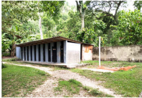
▲ Milot high school bath house the collapsed septic tank ►

4 - finish the gables on the new chapel at Biclaire.