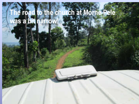
The road to the church at Morne Pele was a bit narrow!