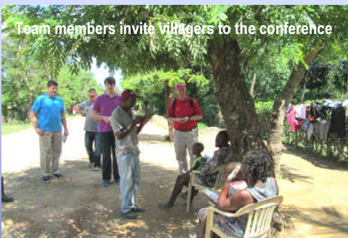
Team members invite villagers to the conference

GSM conducted our annual Bible Conferences in 5 Haitian churches across northern Haiti April 6 - 9. There were 5 meetings in each church. Total attendance for the week was around 6000 people, with many decisions being made for Christ. 8 pastors and 3 laymen preached and shared testimonies during the course of the week. What a blessing!