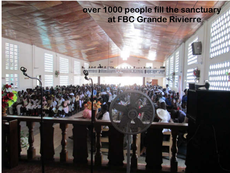
over 1000 people fill the sanctuary at FBC Grande Rivierre