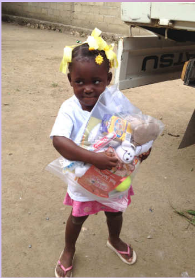
Like hundreds of other children Christmas Week, this young lady heard the Good News of Christmas and was loved by God's people - this is "The Hope of Christmas" ◀