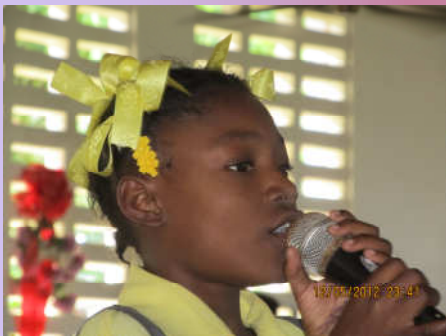
▲ The children prepared programs to share with the Christmas team - songs and recitations of scripture