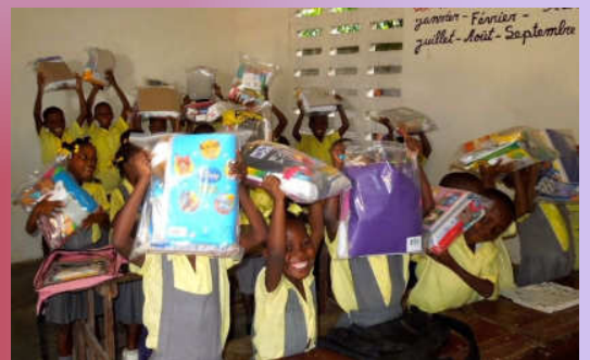
▲ No captions needed ▼