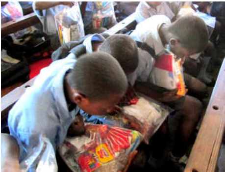
▲ inspection time

And it must be noted, to the credit of the Haitian children, that this " preaching " is just that - genuine preaching - thirty to forty-five minute sermons - like you would hear in big church at your home churches - and the children remained attentive, engaged, and disciplined to the end of the service.