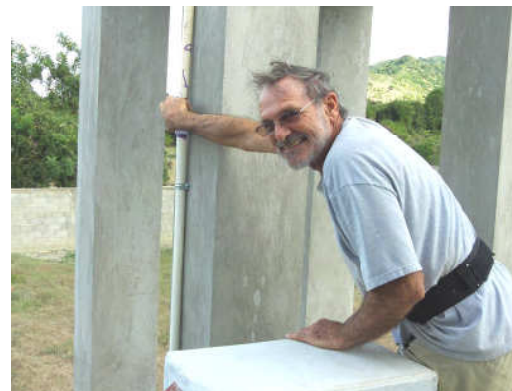
▼ turning the water on for the first time - will it work? YES!