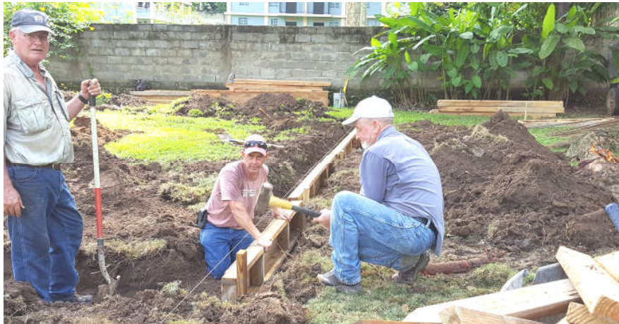
▲ forming the pad in Nov

A group of men from FBC Geraldine came in February to erect a building on the concrete pad that was laid by the men that came with the Fall Medical Team some months earlier. It is a marvelous thing to see how churches work together for the Lord. The men in November had to set anchor studs in the concrete such that when the men came to install the metal beams onto the anchors, everything had to line up perfectly - within tolerances of perhaps 1/4 inch - and it did! I think everyone breathed a sigh of relief when it all lined up just right. We thank the Lord for His amazing grace, and brothers in Christ that work together.