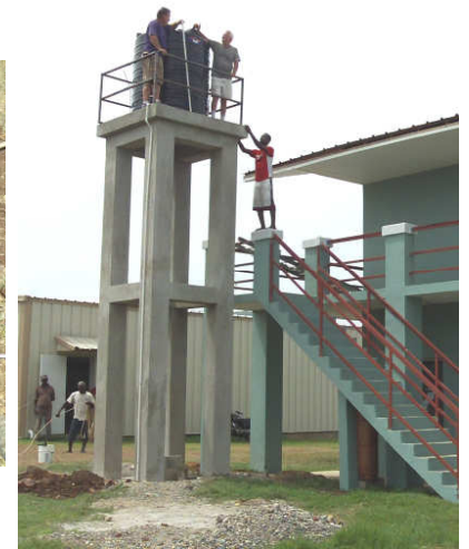
▲ building the water tower