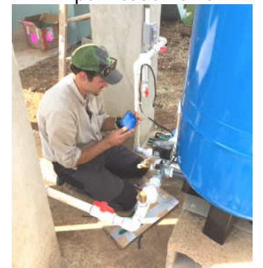
▼ installing the water purification unit