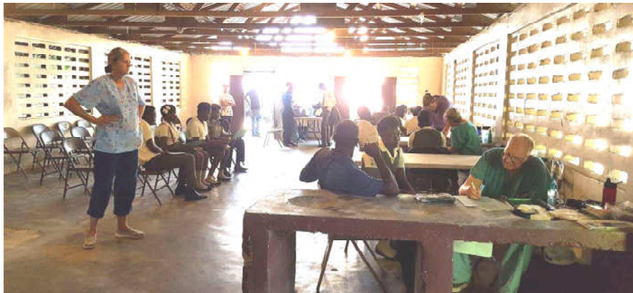
▲ the Clinic at Milot

We are grateful to those who come and minister to our school children and staff.