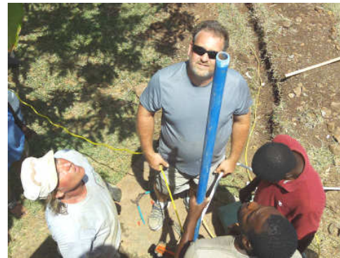
▲ installing the well pump at Savane Carree