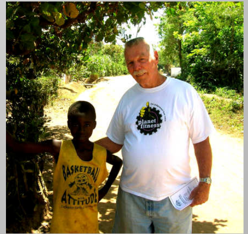
... with a Haitian friend ▶