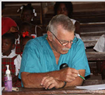
▲...in the GSM Grand Riviere pharmacy