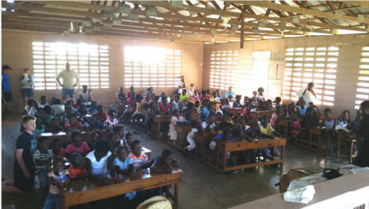
◀ Worship & Bible Study

Thanks to the Lifepoint Church of Palm Bay, FL for hosting a great Bible Camp for our children this year. Camps were conducted on all three of our campuses: Milot, Biclair, and Savane Carree. Hundreds of children were ministered to. The Salvation of Jesus Christ was proclaimed !