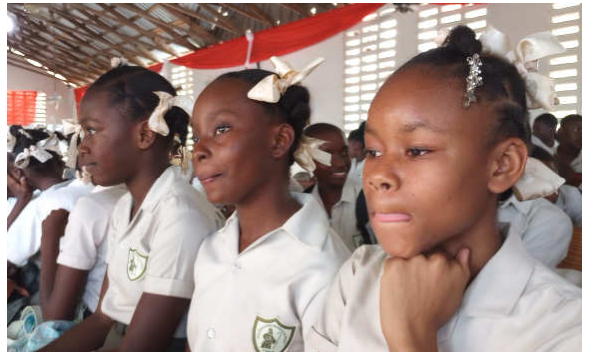
High School girls listen to the Christmas Gospel message. ▶