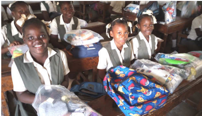
▼ Young people gathered for The Christmas Gospel worship service.