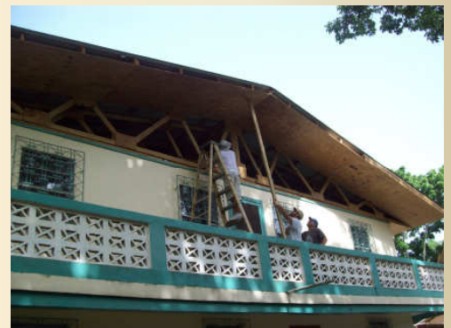
Finishing up the soffit and fascia on our new roof