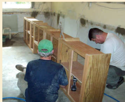
Termites had made too many good meals out of our kitchen cabinets, so new ones were built.