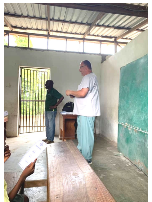
preaching the message, “ The Love of God ”.