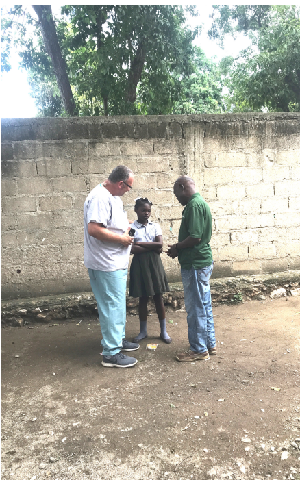
sharing Christ one on one