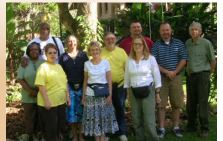
Team 1 came together from FL, KS, AL !