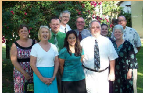
Team 2 came from AL & GA