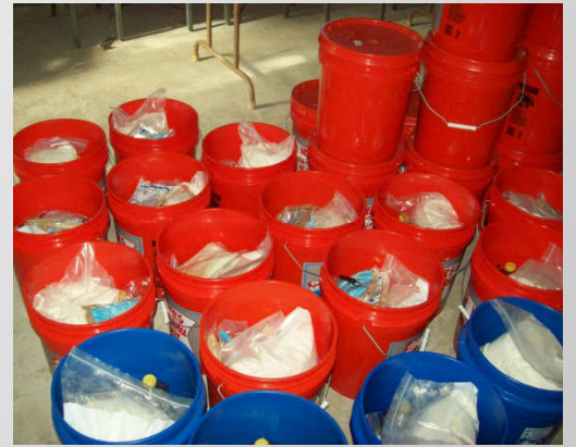
Buckets of Hope were shared with many