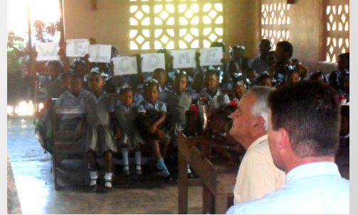
These children made a "Welcome" sign for the team - in English!