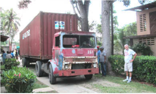
Bill welcomes the container