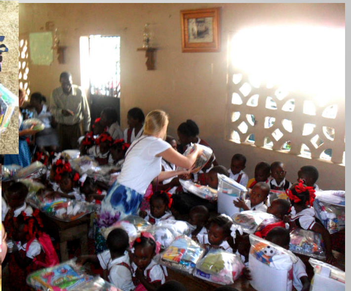
Hundreds heard the gospel