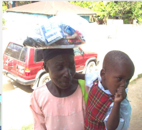
This grandmother carried her child in her arms and his bag on her head!

2013 was a great year for "The Hope of Christmas" - the GSM Christmas ministry to Haiti. Thank you to all of the churches and groups that provided Christmas bags. And thanks to the several churches that helped in the distribution. Pictures can tell the story!