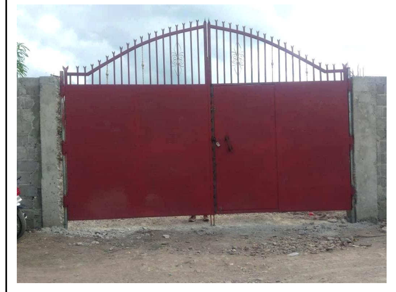
the new gate at the western entrance