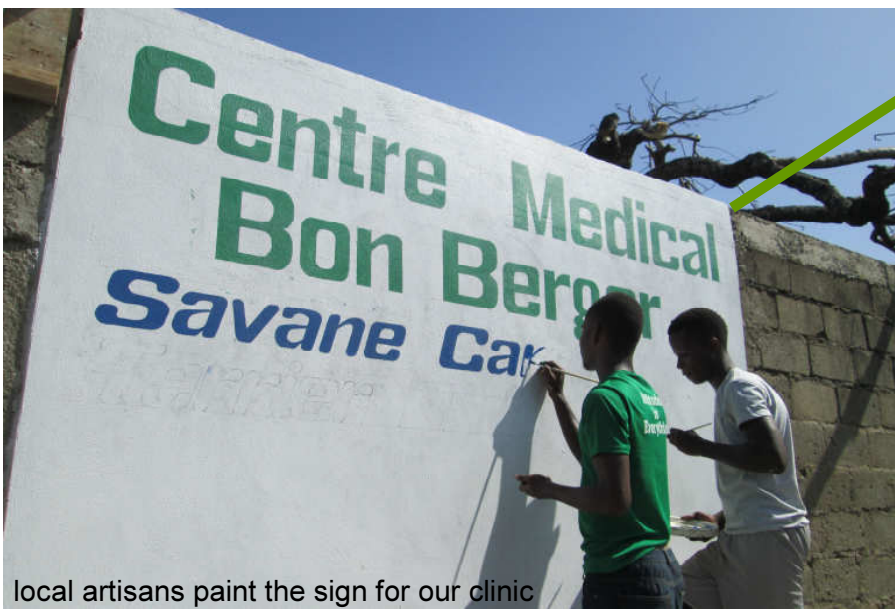
local artisans paint the sign for our clinic